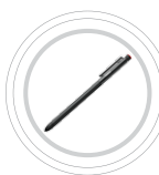
ThinkPad® Digitizer Pen