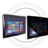
Anti-glare and Privacy filter