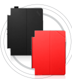
ThinkPad® Quickshot Cover