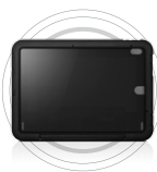
ThinkPad® Helix Protector