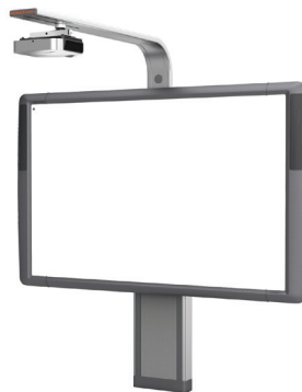
ActivBoard 300 Pro Adjustable with PRM-30a or PRM-35 projector