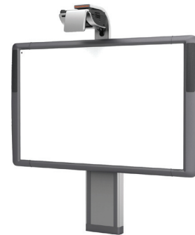
ActivBoard 300 Pro Adjustable with EST-P1 projector